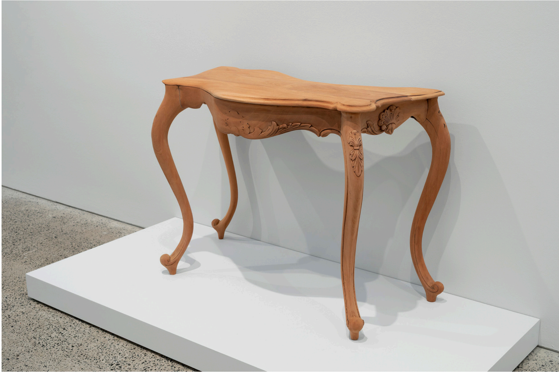
Merric's table 2025, mahogany, 74 x 108 x 51.5 cm, $12,000.00