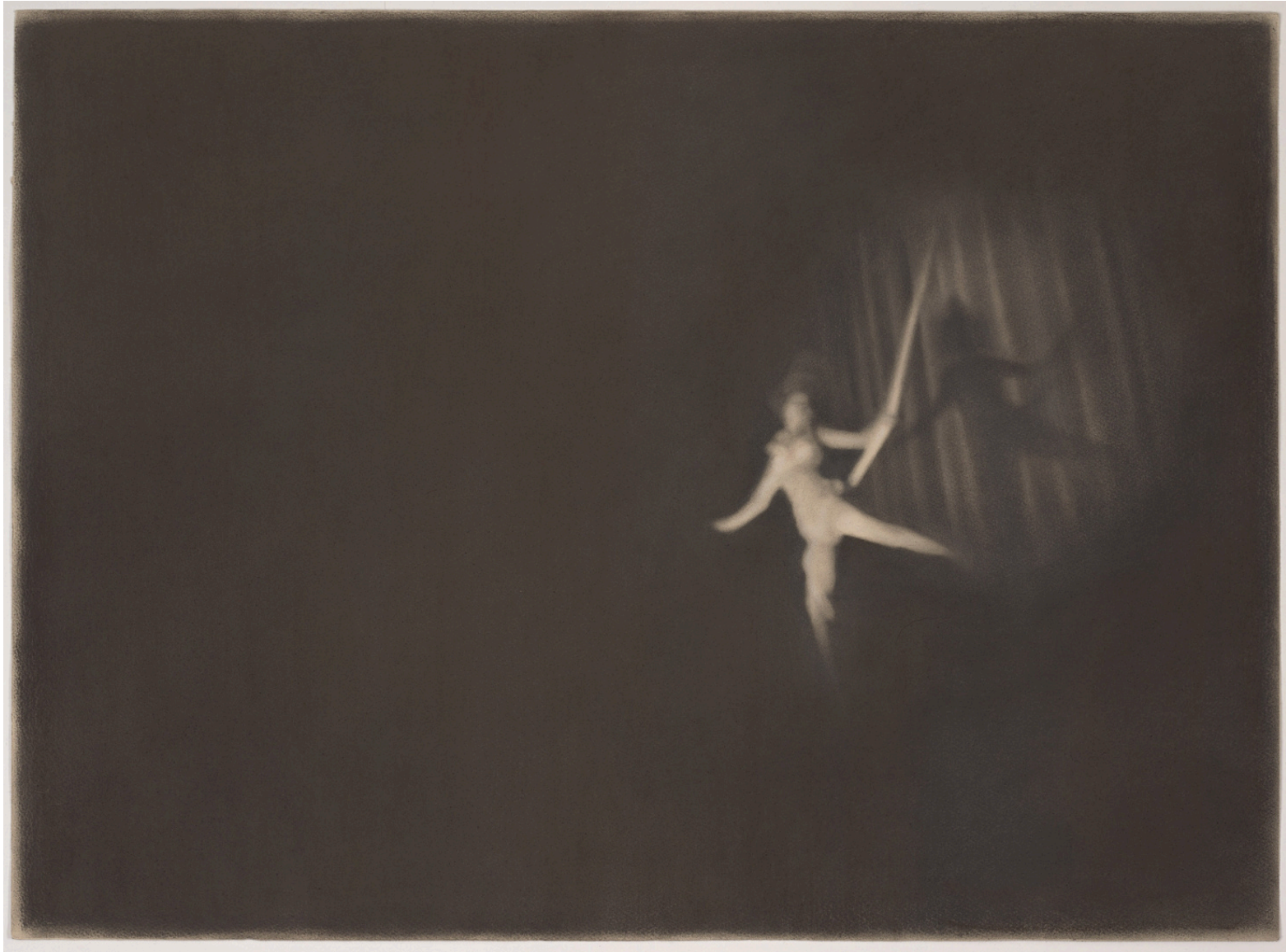
The Spanish Web 2025 , pastel on velvet paper, 56 x 76.5 cm, $6,950.00 (framed)