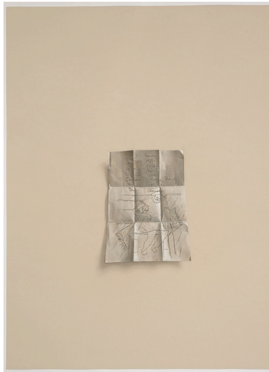
Joy's list 2025 pastel on velvet paper 76.5 x 56 cm $6,950.00 (framed)