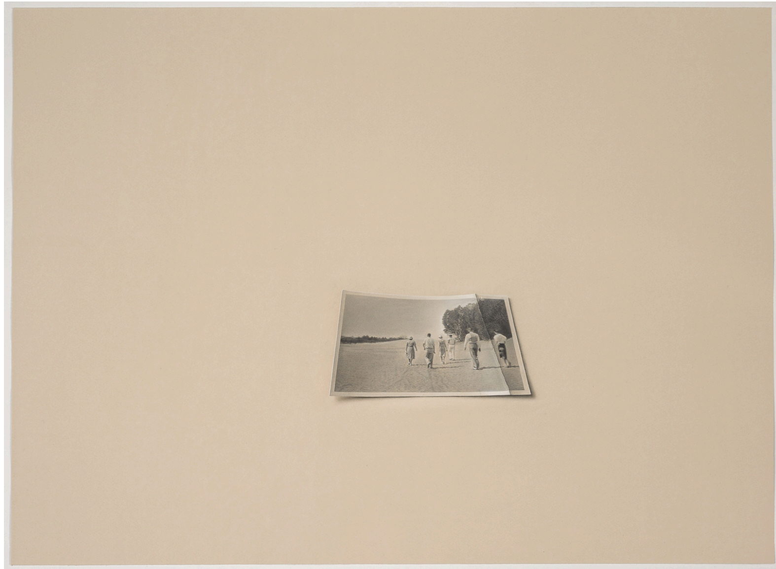
I think it's better we wait until after the war 2025, pastel on velvet paper, 65 x 76.5 cm, $6,950.00 (framed)