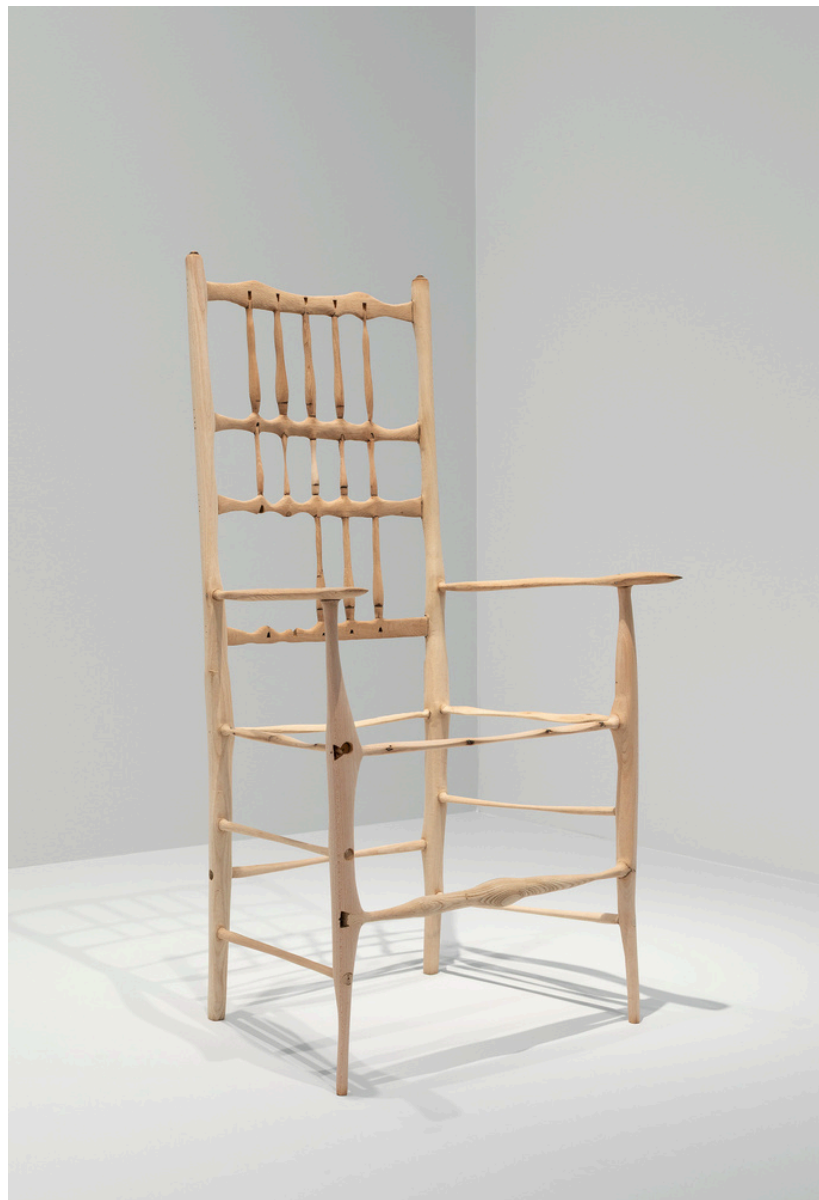
Heide dining chair 2025, oak, 110 x 57.5 x 54.5 cm. $9,000.00