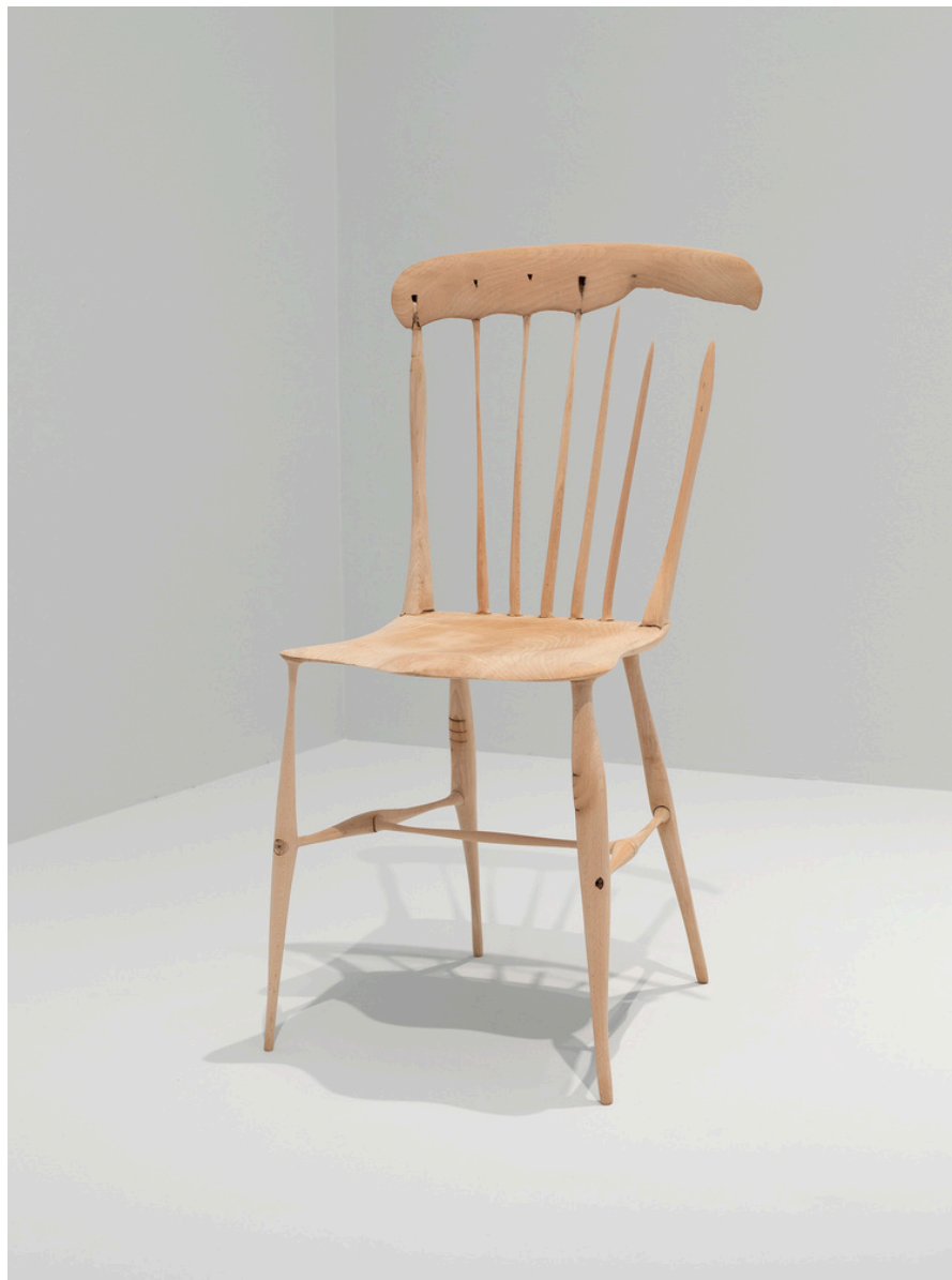
Joy's chair 2025 , maple, 86 x 45 x 45 cm, $9,000.00