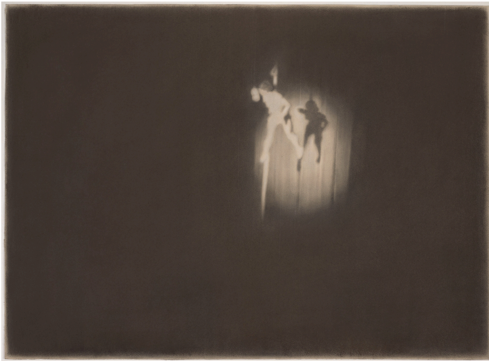
At the Tivoli 1940, 2025, pastel on velvet paper, 56 x 76.5 cm, $6,950.00 (framed)