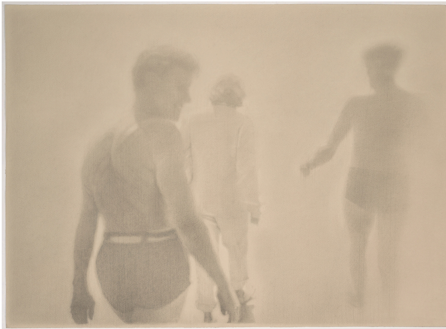
He could feel those things I feel 2025, pastel on velvet paper, 56 x 76.5 cm, $6,950.00 (framed)