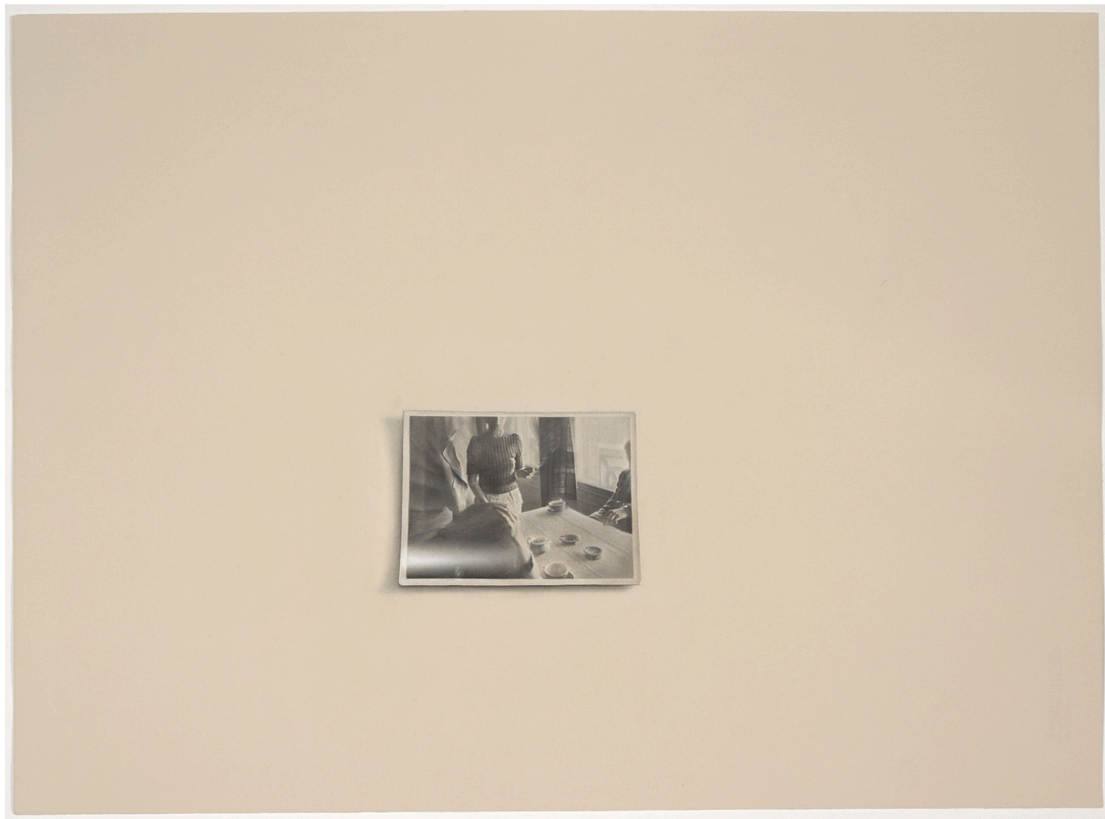
21 flying fortresses came over here very low yesterday 2025, pastel on velvet paper, 56 x 76.5 cm, $6,950.00 (framed)