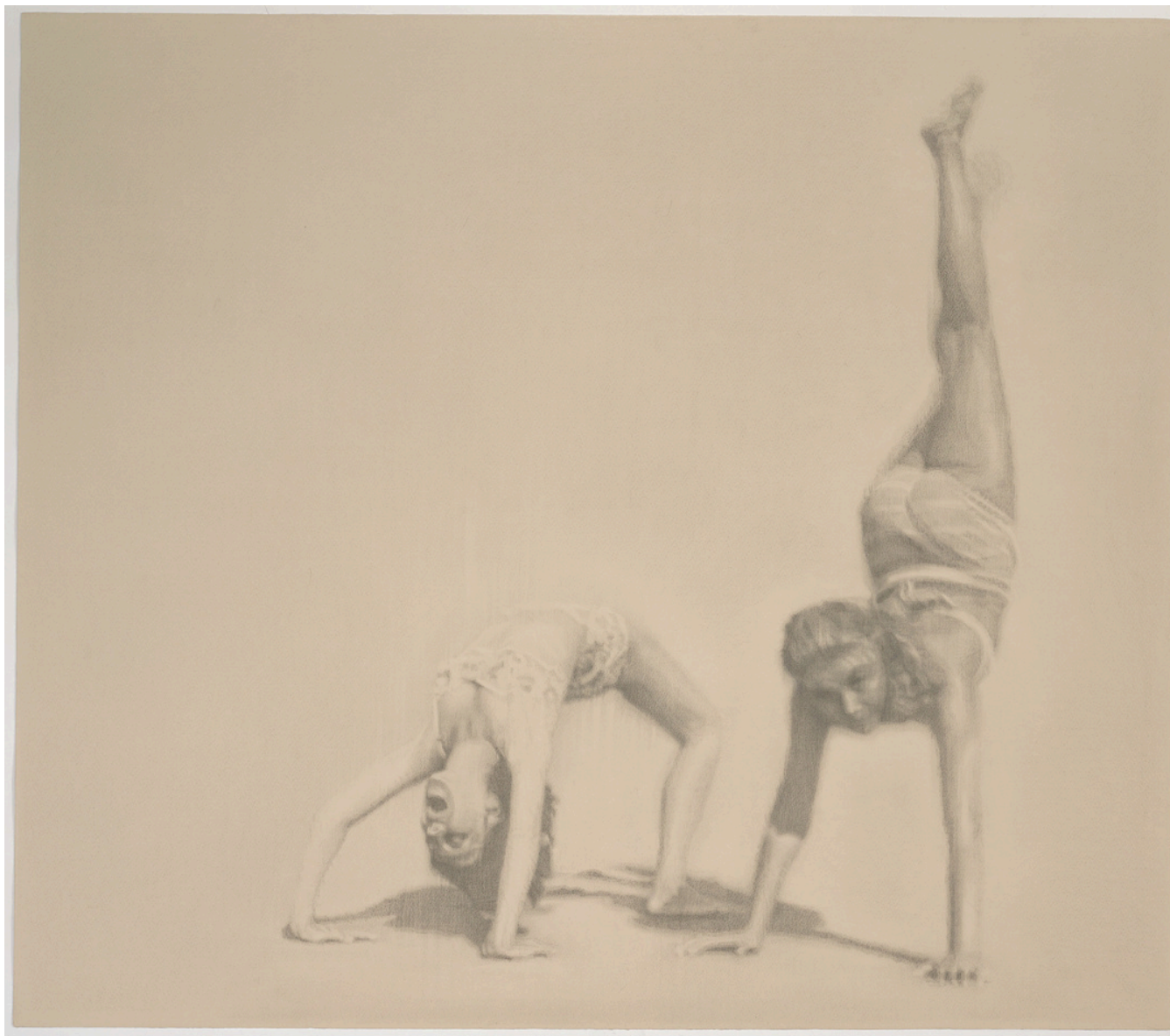
There is nothing in the world I couldn't do 2025, pastel on velvet paper, 76.5 x 87.5 cm, $8,500.00 (SOLD)