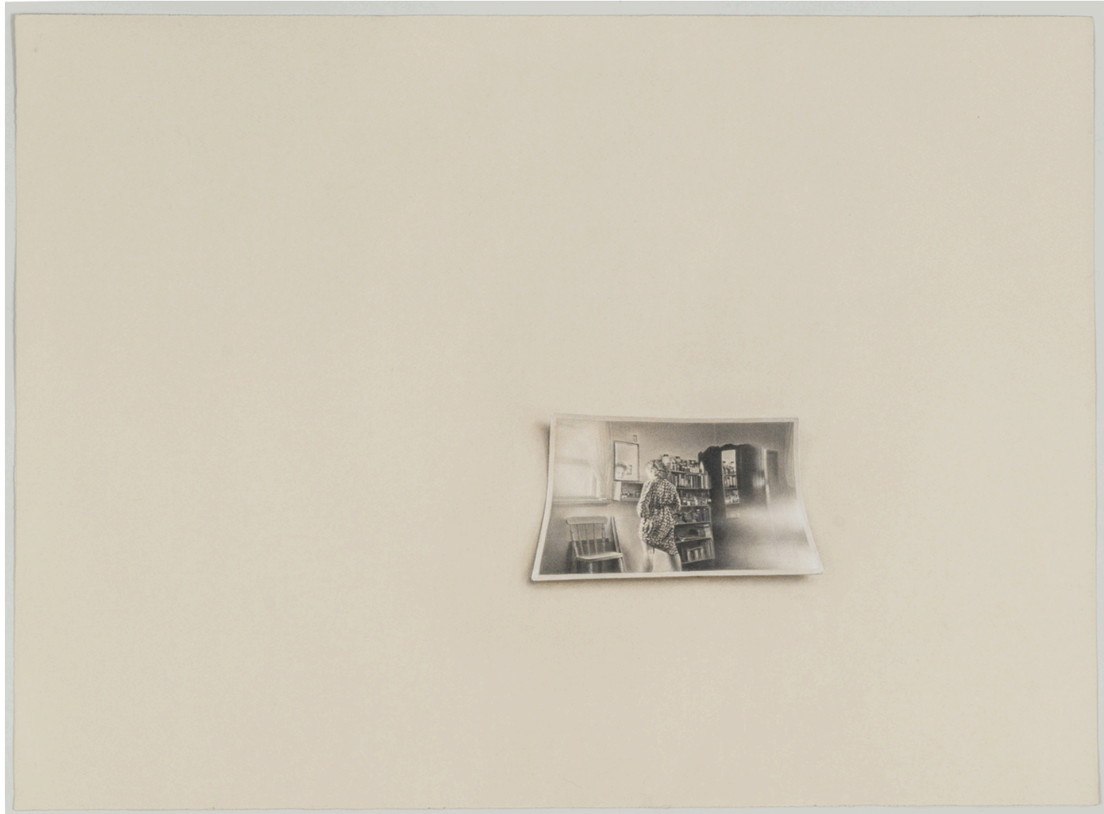
And I would say these things to no one but you 2026, pastel on velvet paper, 56 x 76 cm $6,950.00 (framed)