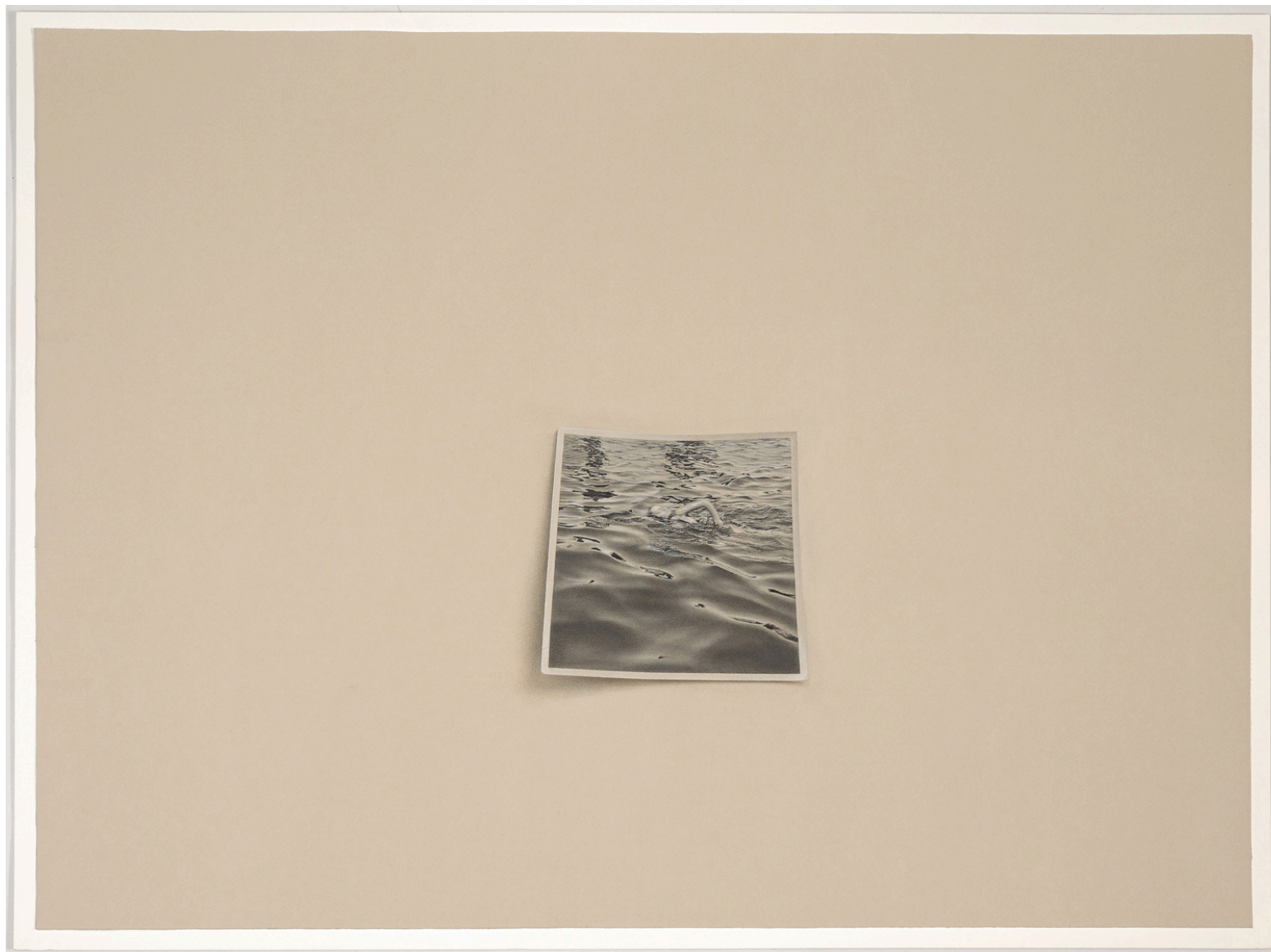
More or less alone in the world 2024 , pastel on velvet paper, 56 x 76 cm, (Not For Sale)