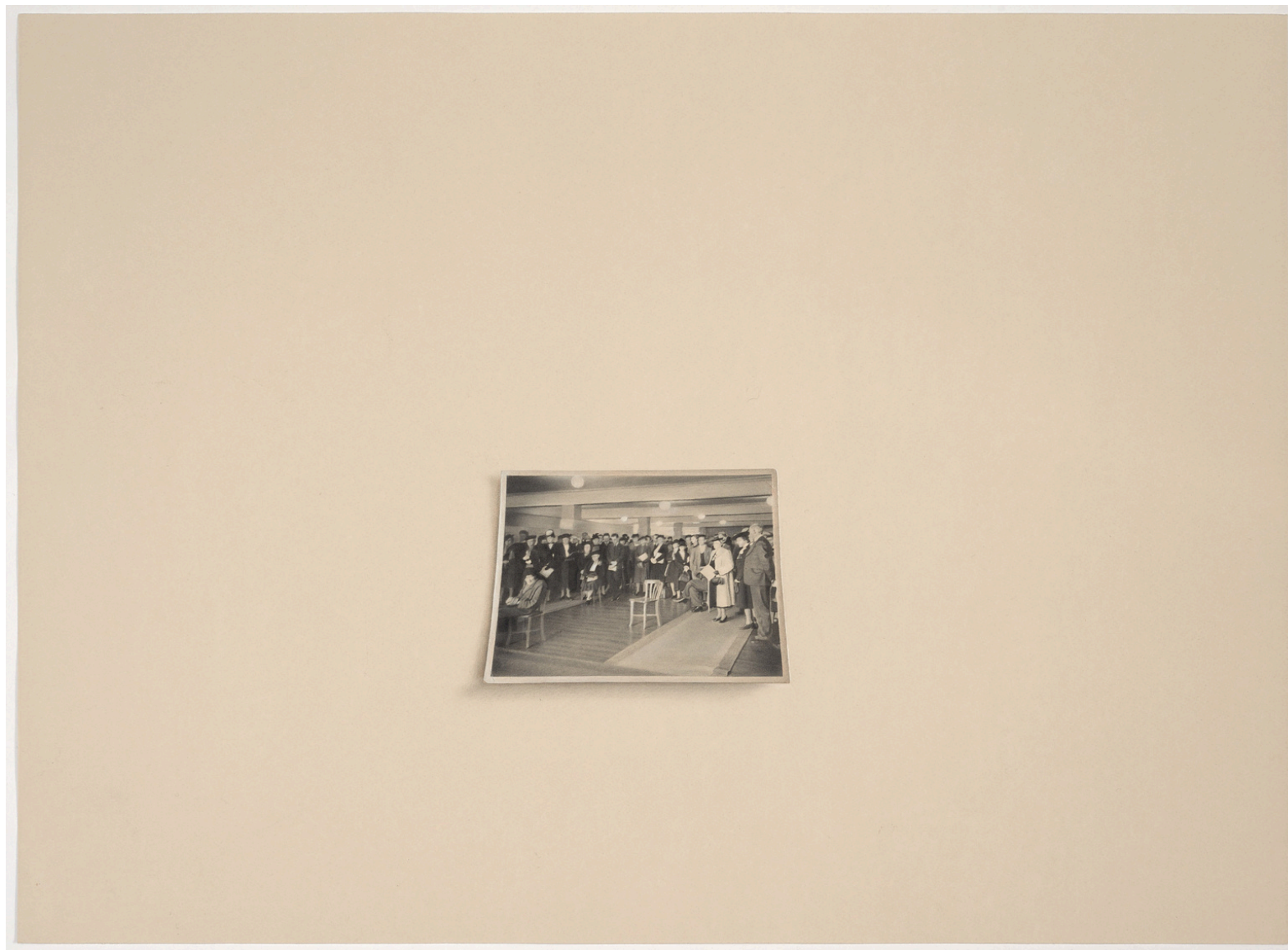
Establishing the Three Little Aussie Painters 2025, pastel on velvet paper, 56 x 76.5 cm, $6,950.00 (framed)